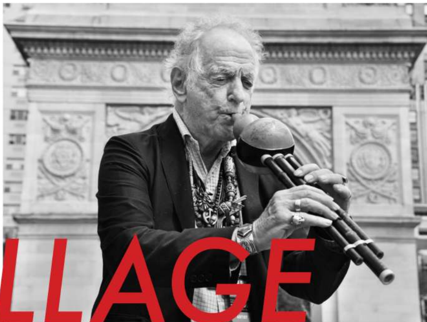
DAVID AMRAM