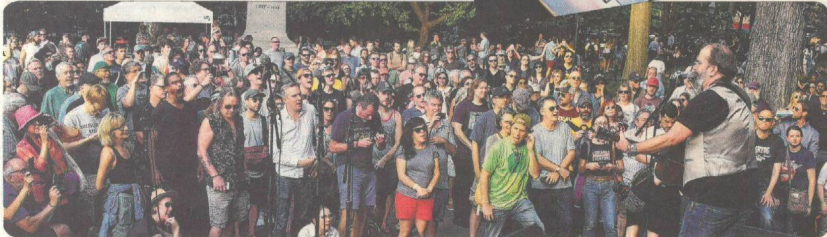
Steve Earle had many in the crowd singing along